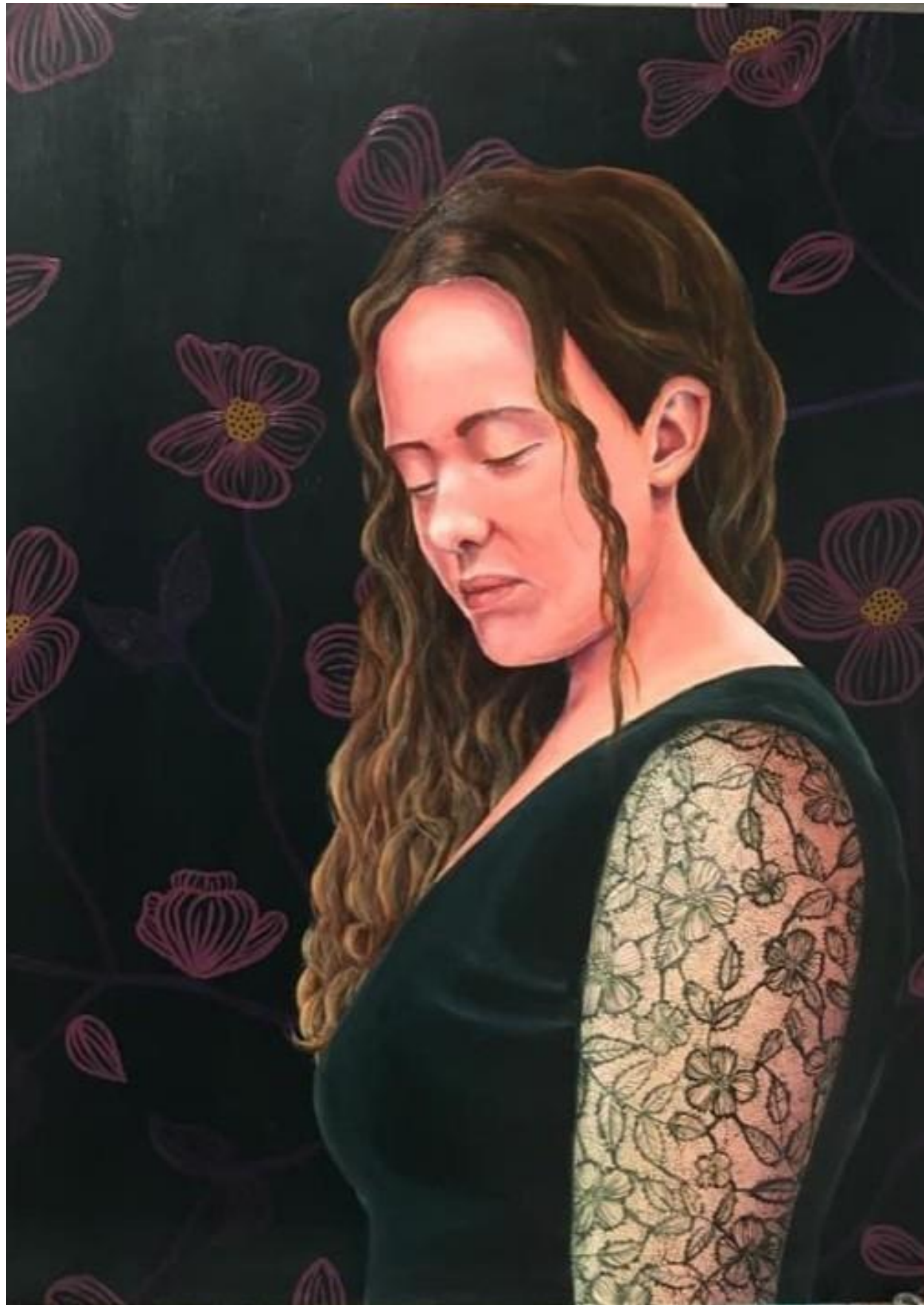
Virginia Girl Acrylic Paint 24 x 18 in.