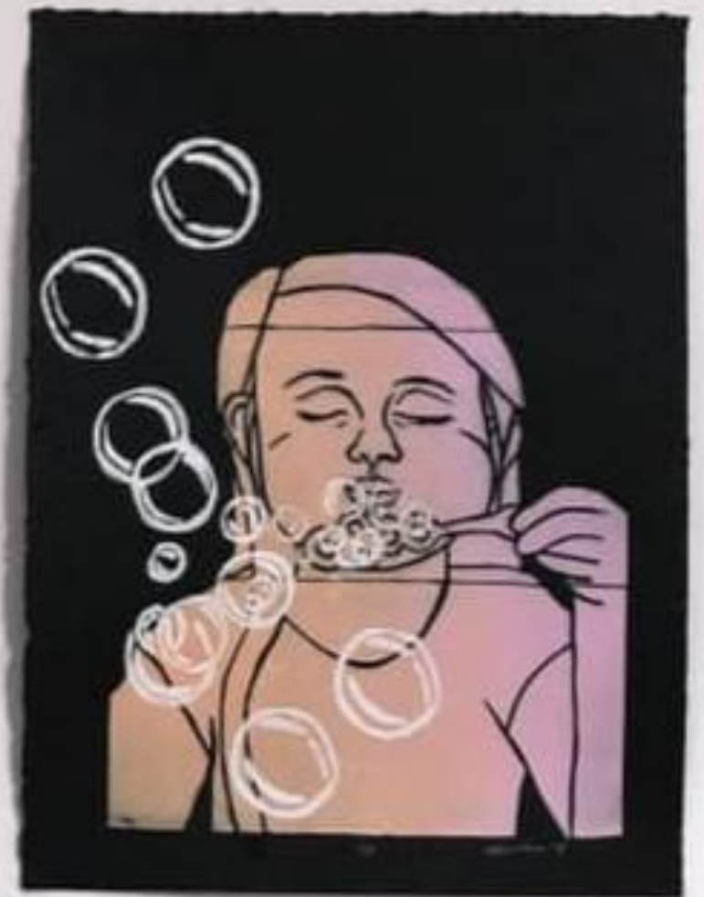
Bubbles Printmaking 15 x 11.5 in. each