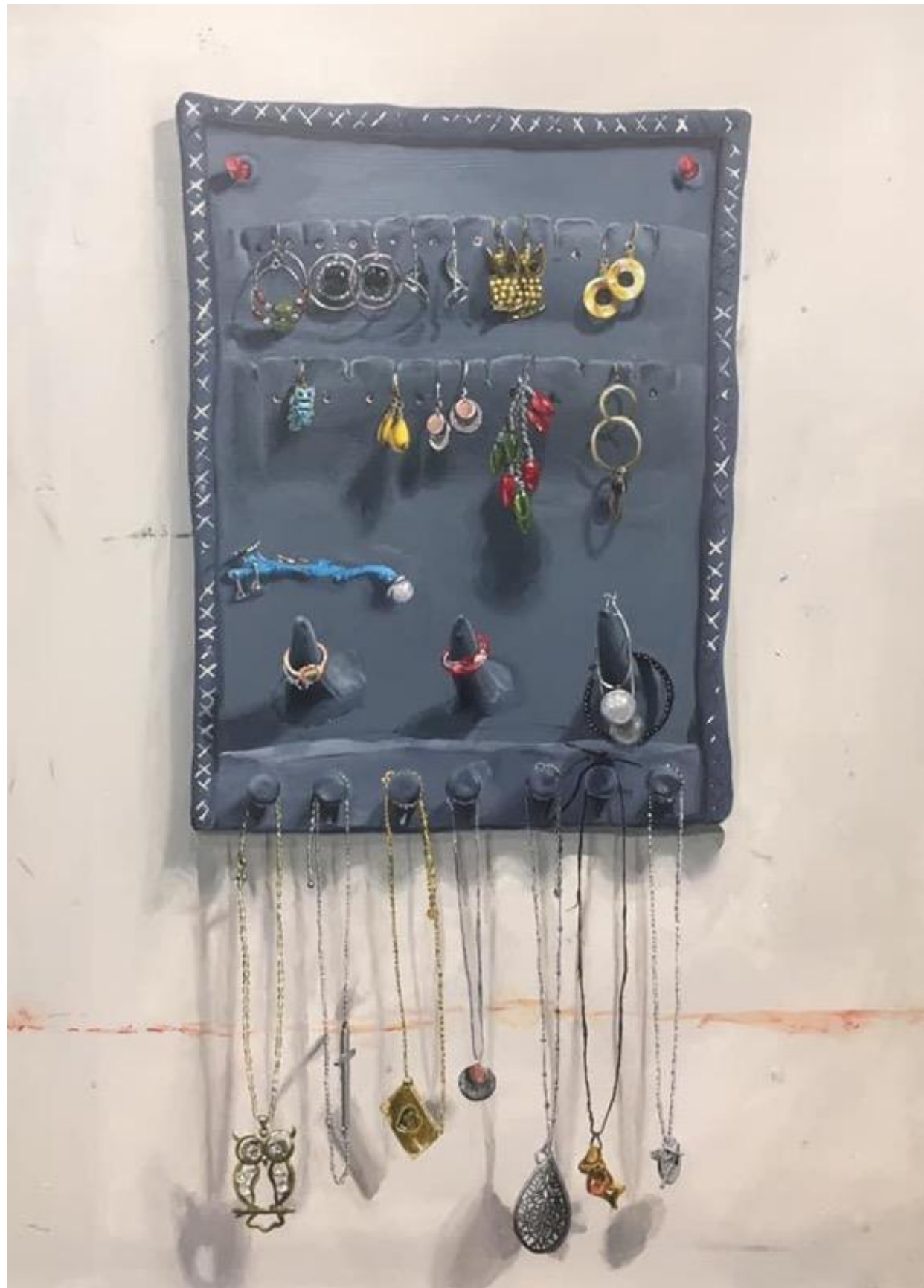
Things I Got From Mom Acrylic Paint 24 x 18 in.