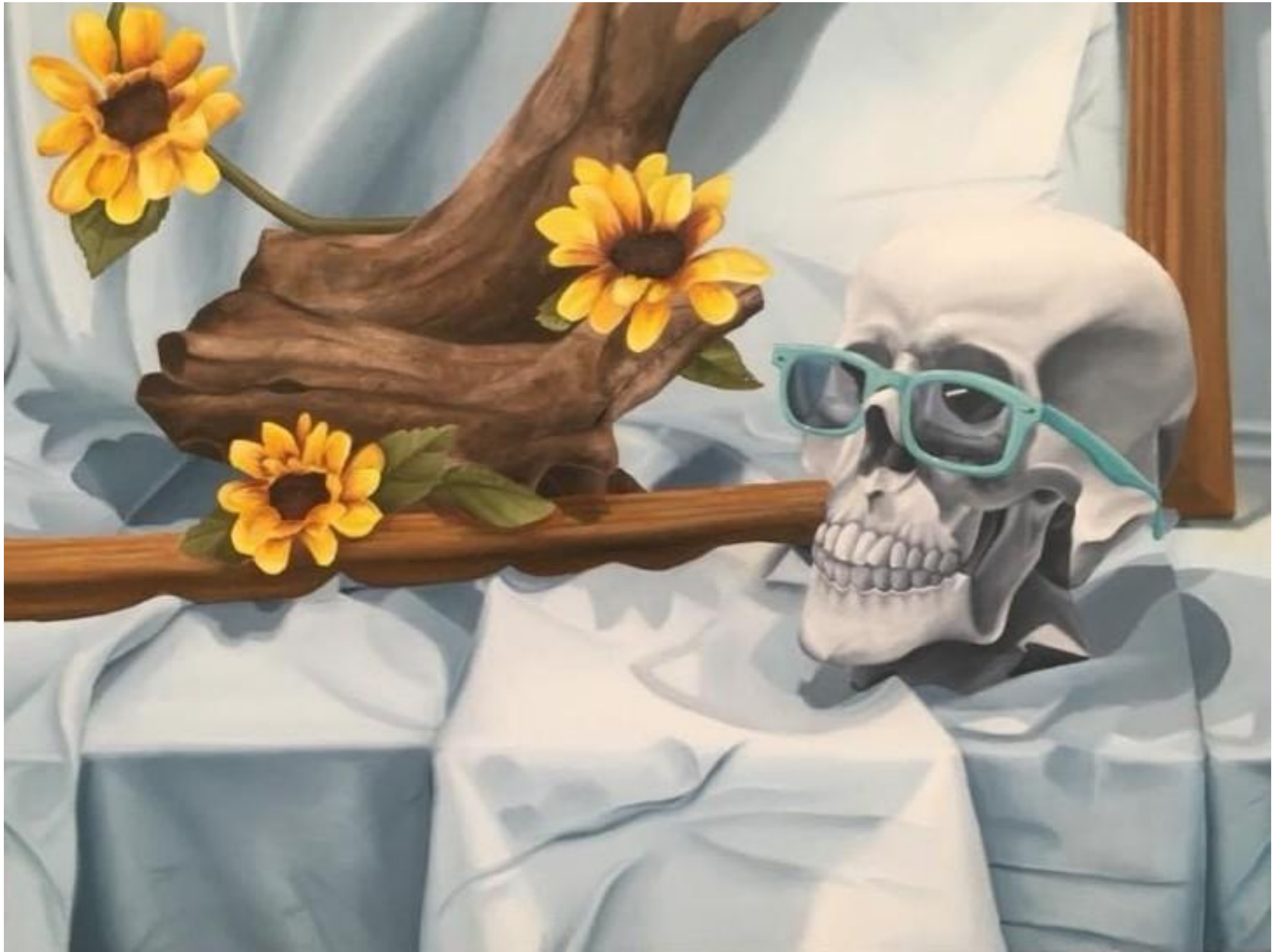
Spring Still Life Oil Paint 24 x 32 in.