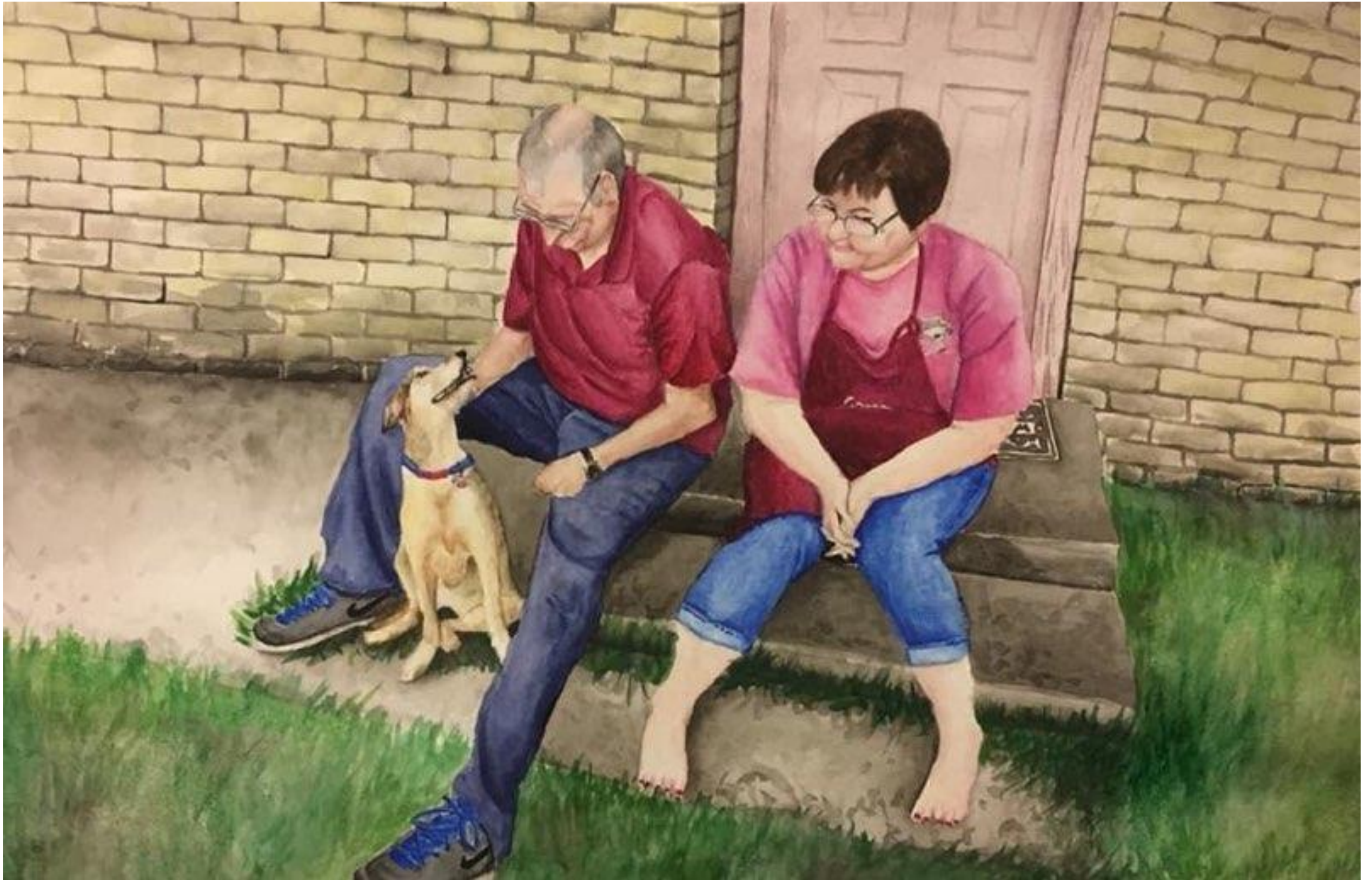
Grammy, Gramps, and Grandpup