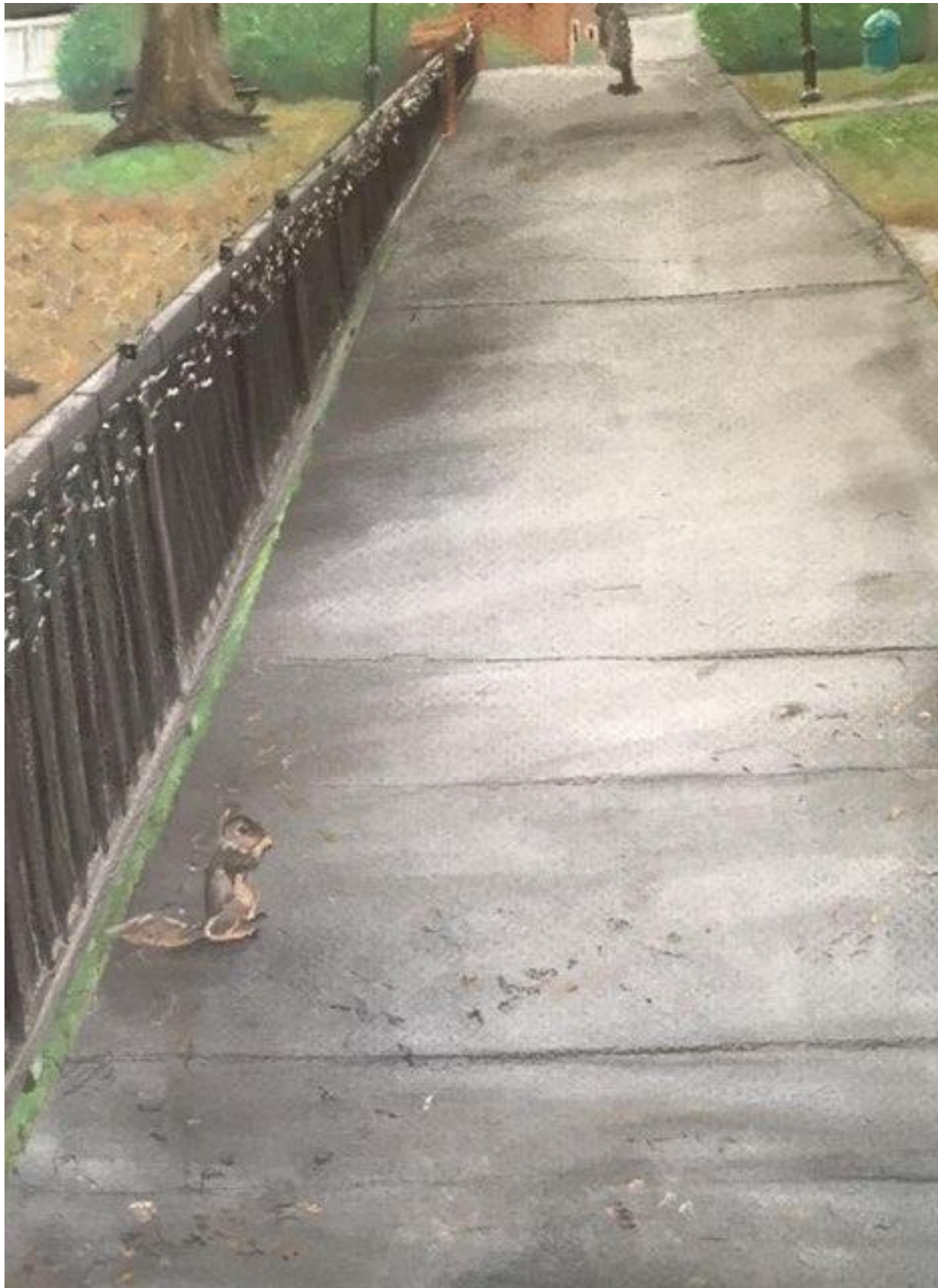
Harding Squirrel Chalk Pastel 10 x 8 in.