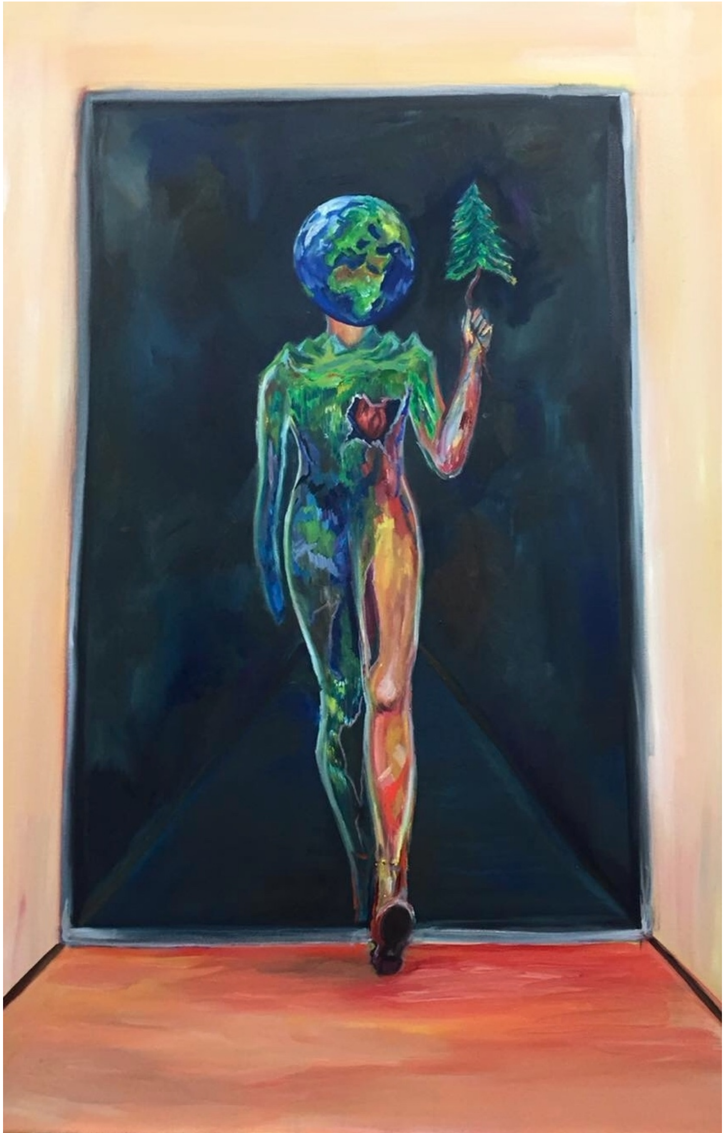
Stepping out of Darkness Oil 36x24 2018