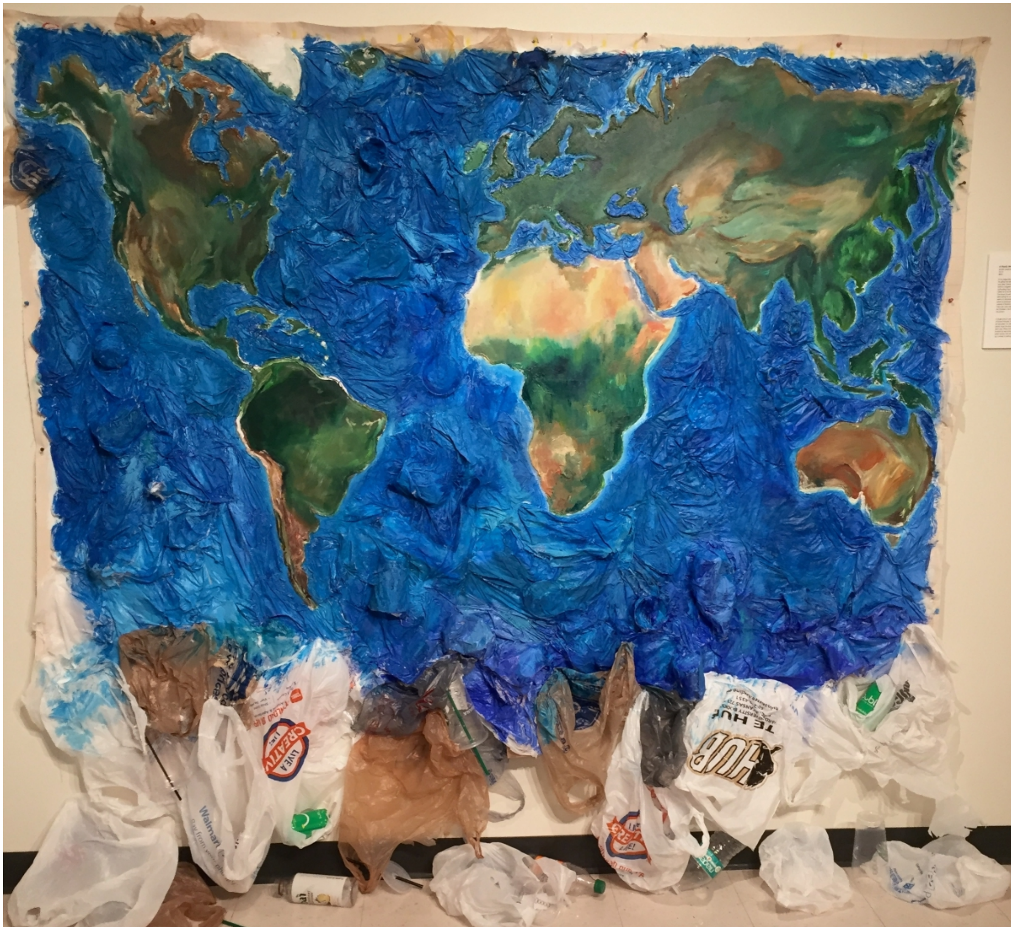
Plastic Earth Mixed Media 60x84 2019