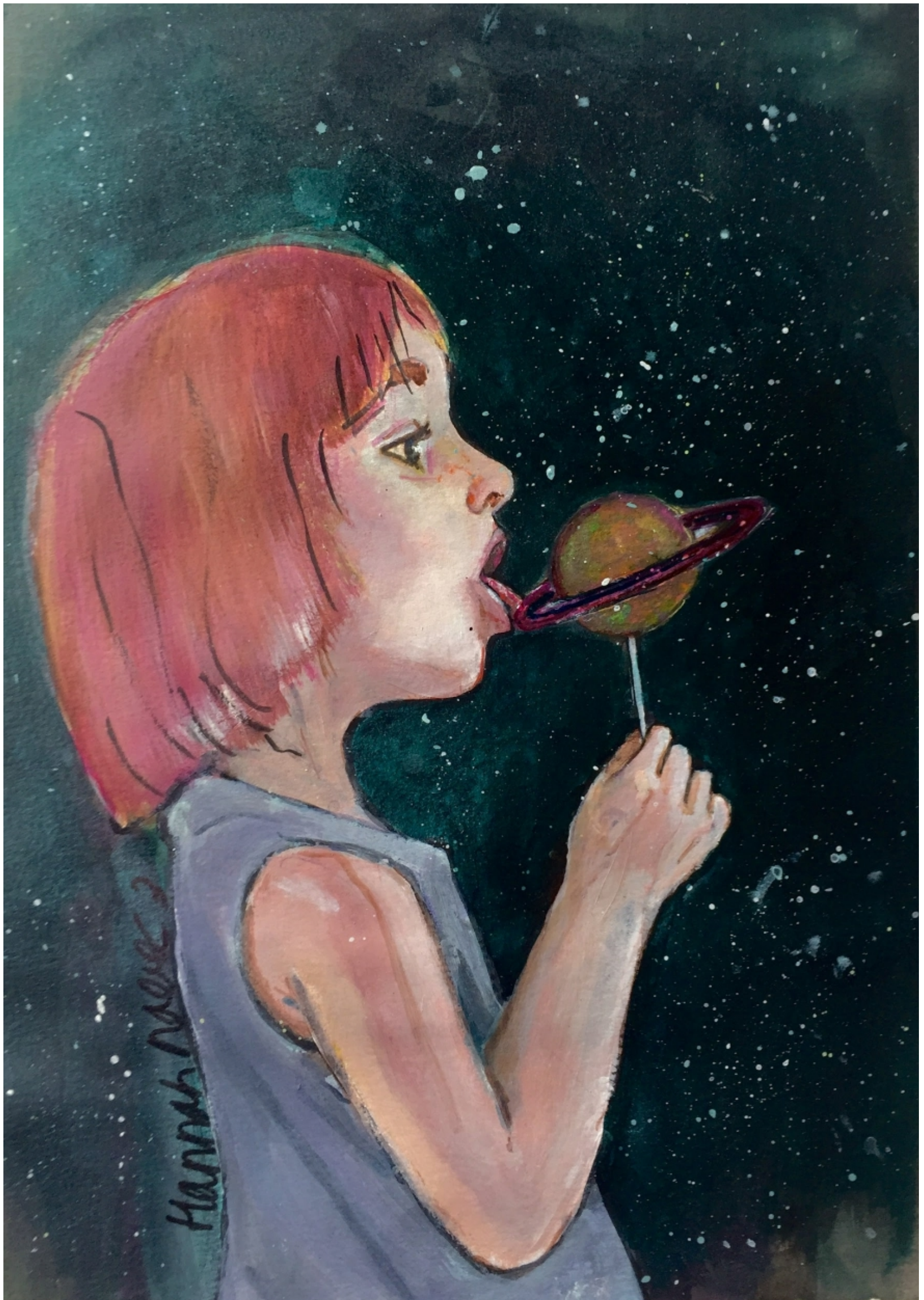
Celestial Lollipops Acrylic 11x14 2016