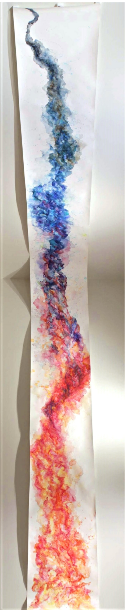
Emotion in Color Watercolor and Gouache 360x33.5 2018