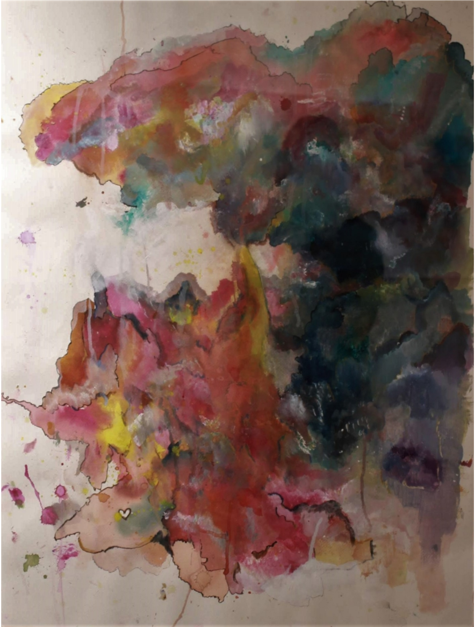
Music in Color Watercolor and gouache 22x30 2016