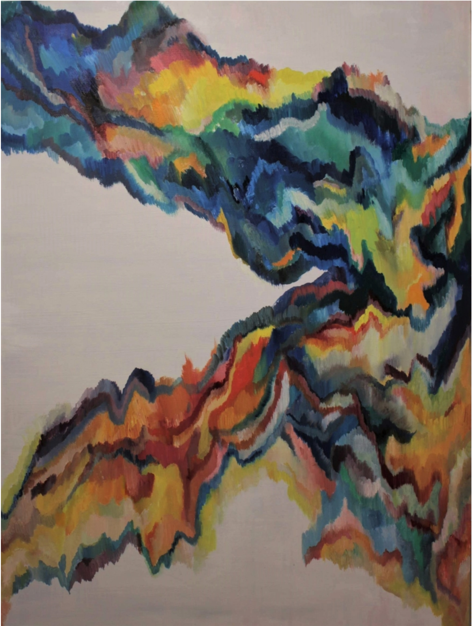
Soul of an Artist Oil 40x30 2018