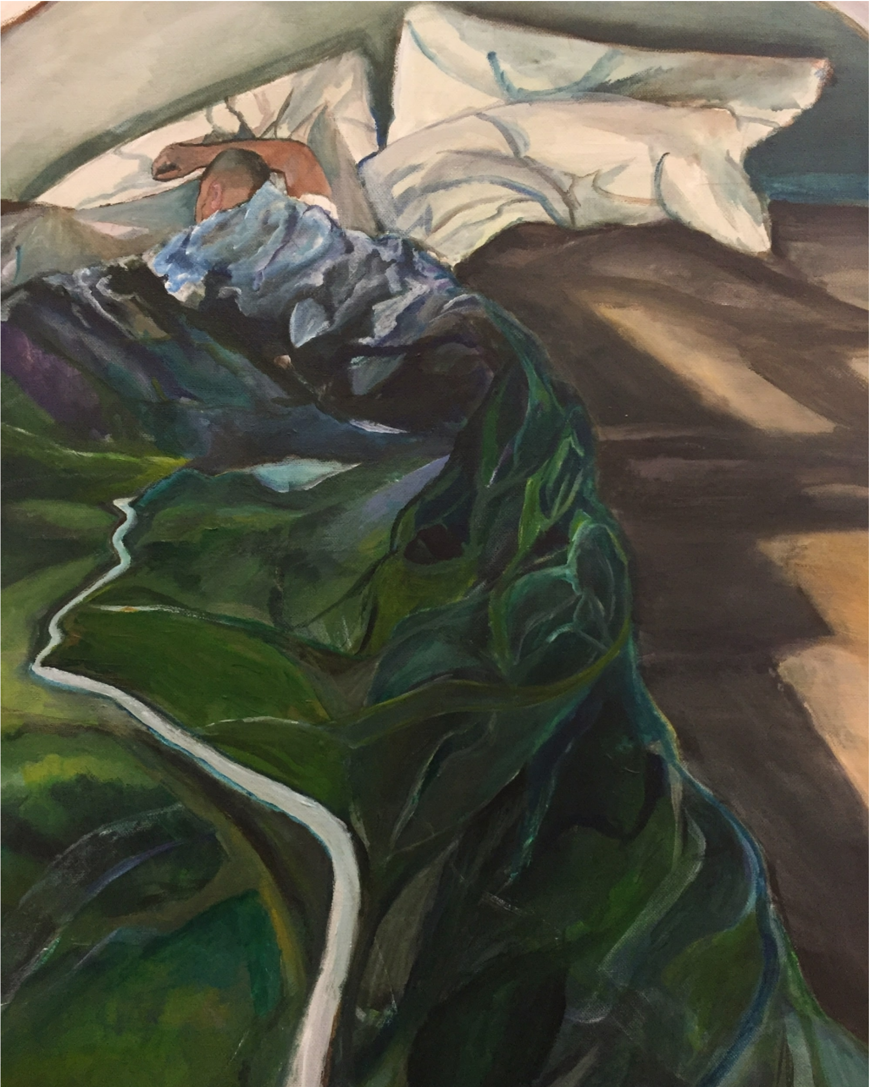
Good Morning World