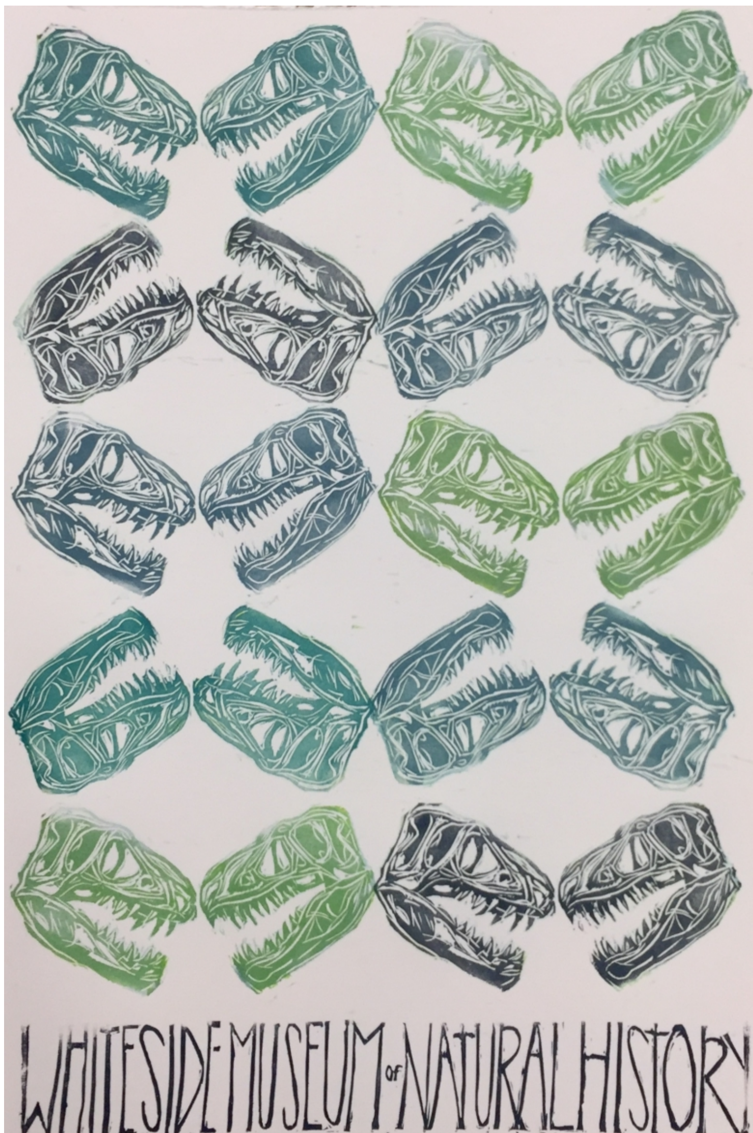
Dino Party Linoleum Block Print 17x11 2019