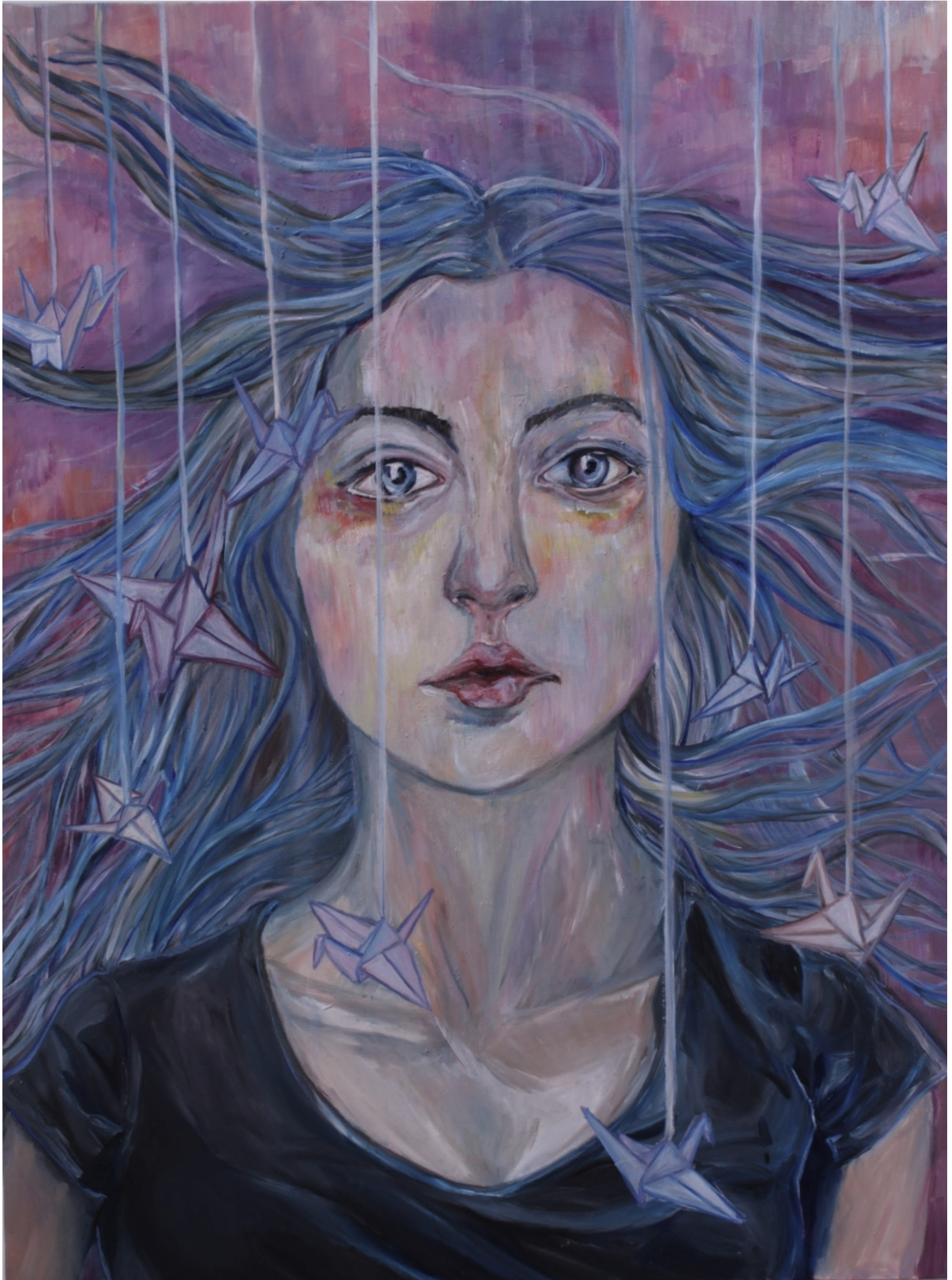
Folding Hope Oil 40x30 2019