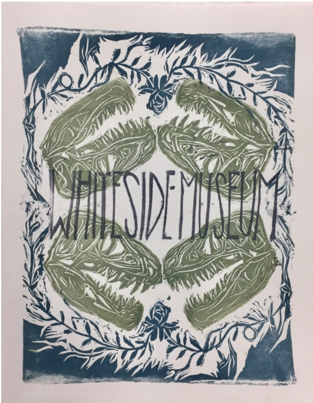
Whiteside Museum Linoleum Block Print 9x7.5 2019