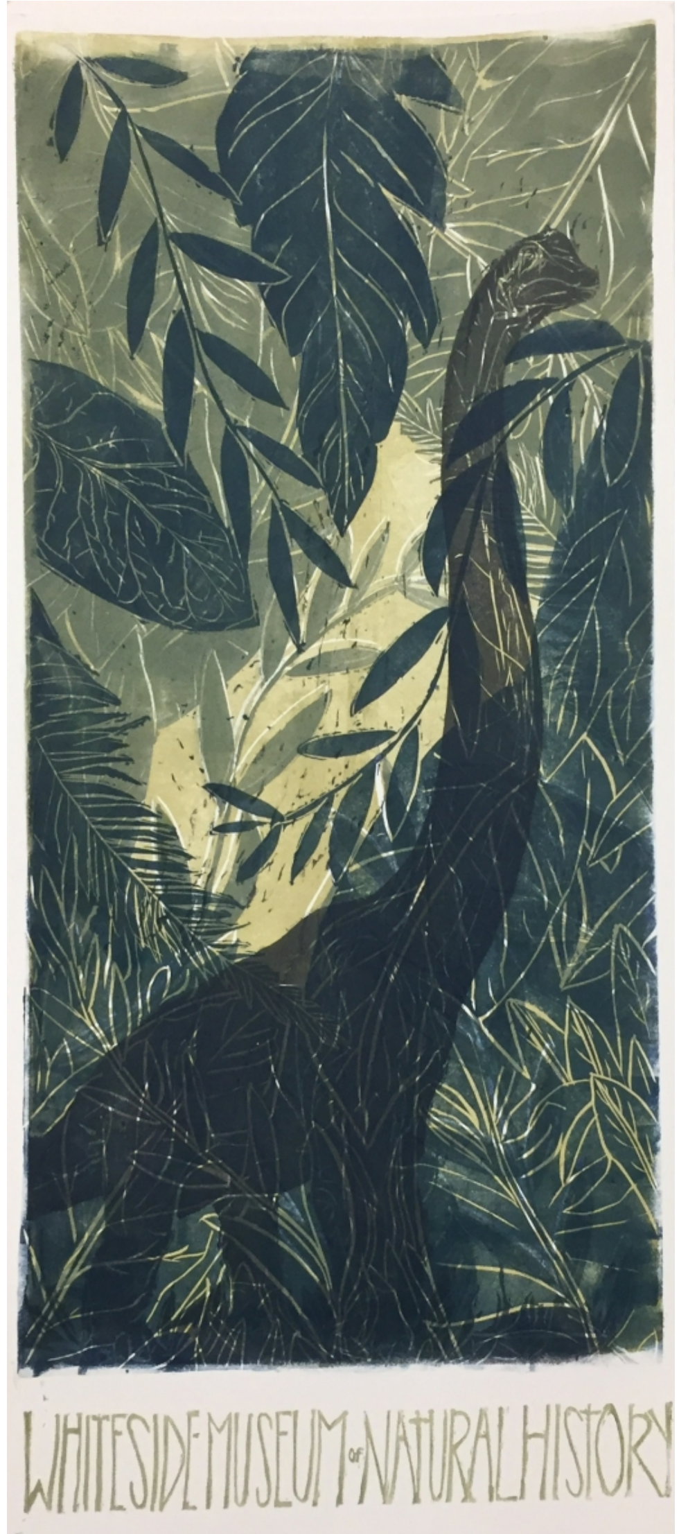
Brachiosaurus Linoleum Block Print 25x11 2019