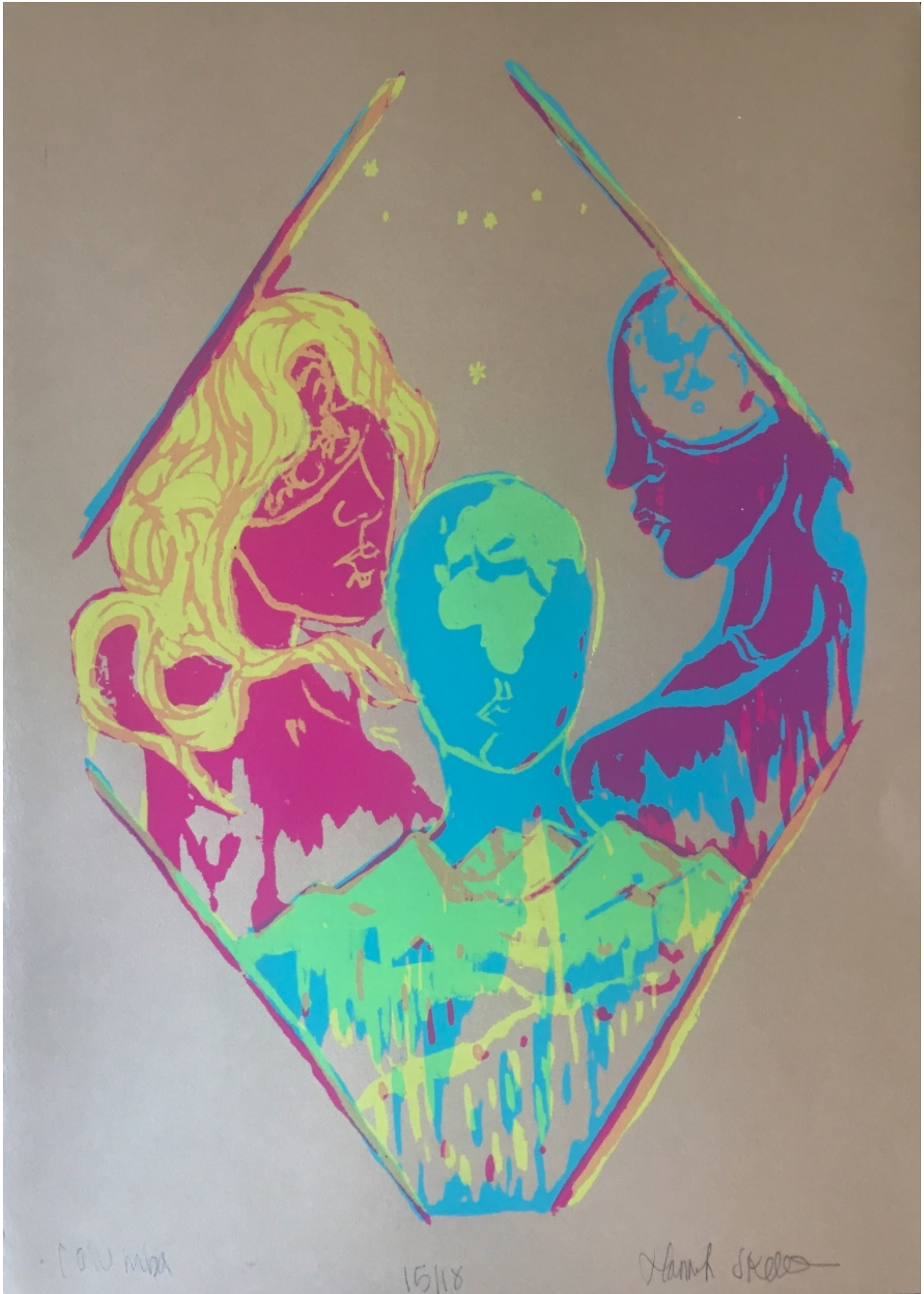
Collumba Screenprint 11x15 2018