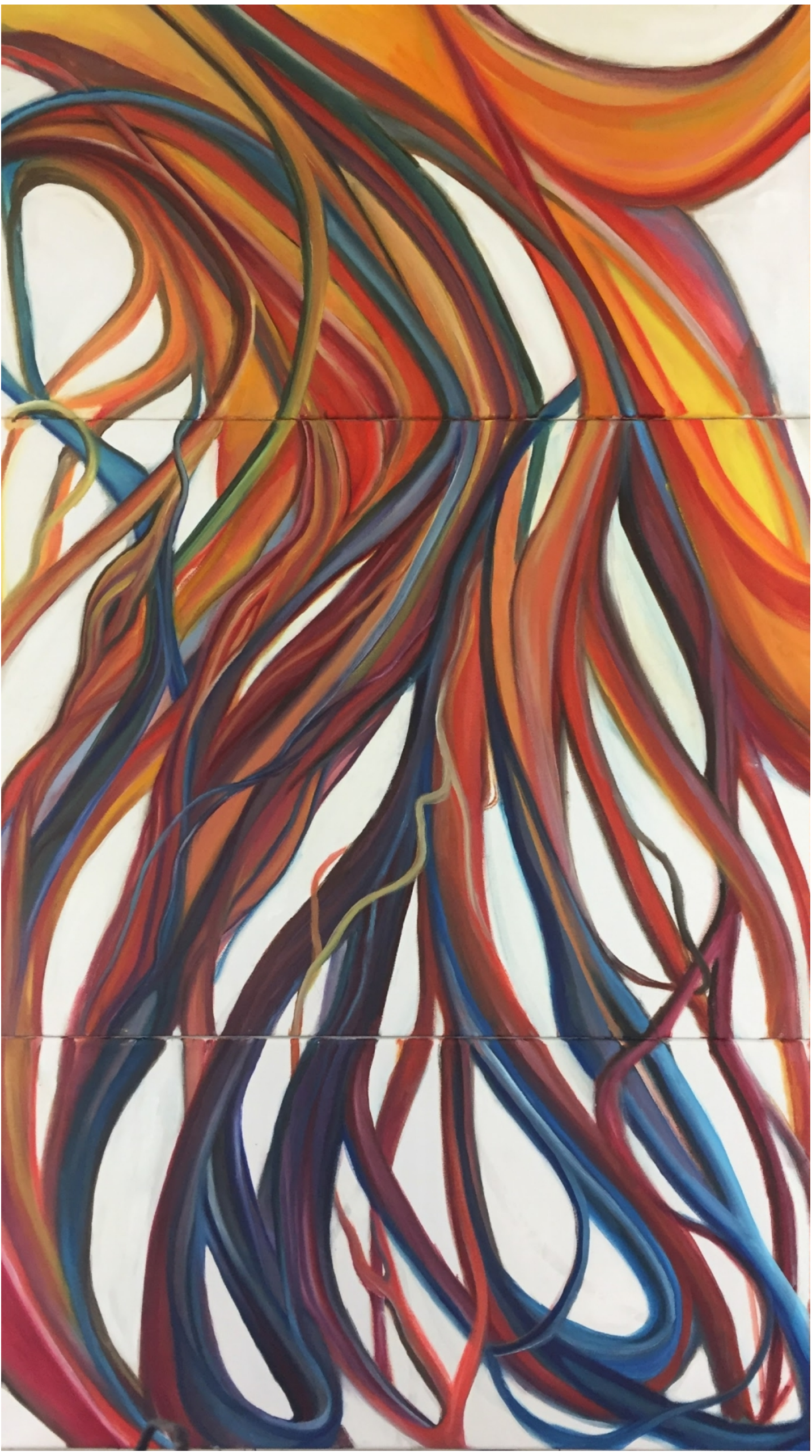
United Oil 42x24 2018