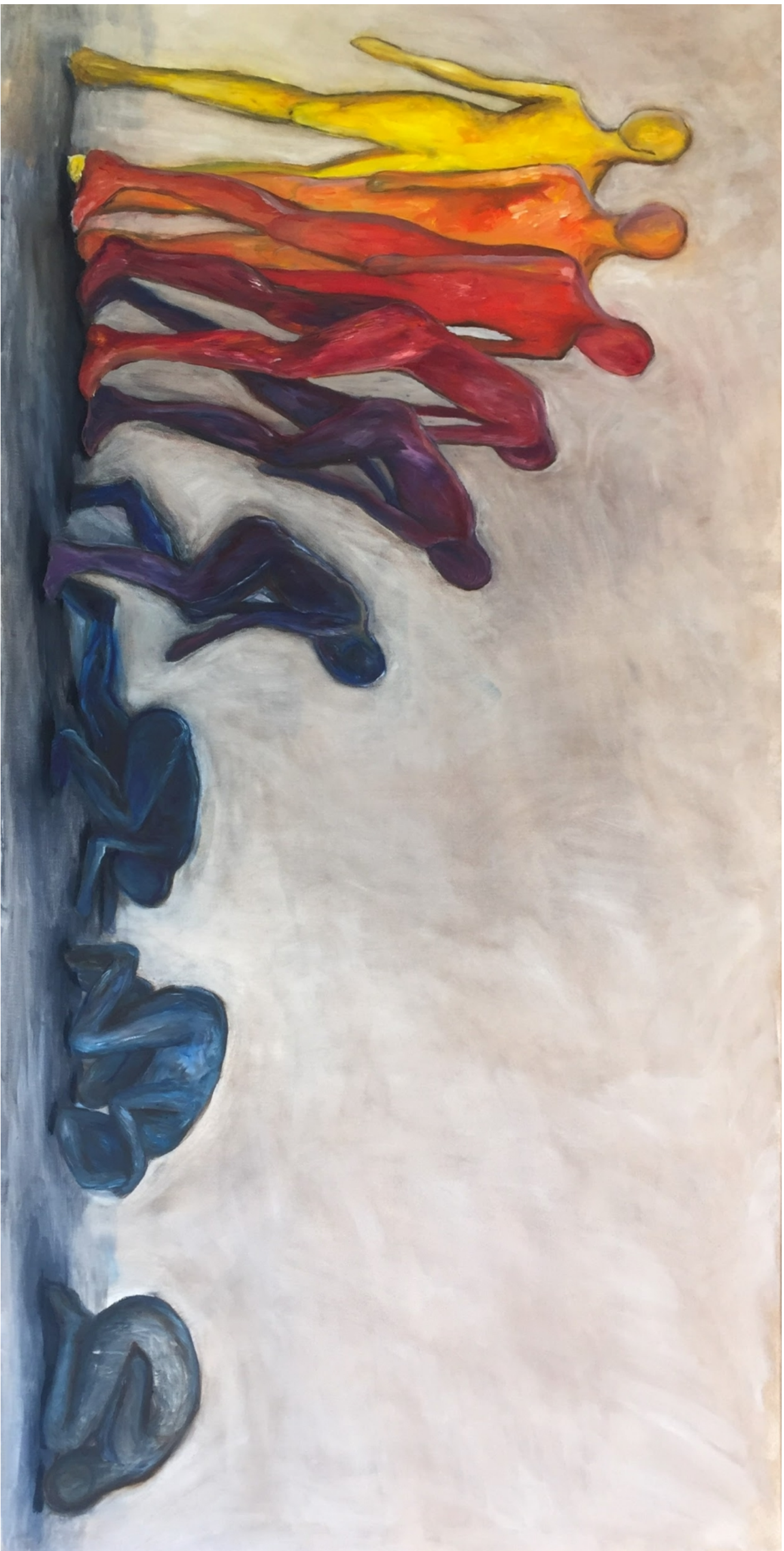
Progression of Depression