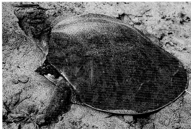
Figure 1. Female Apalone mutica nesting on study site sandbar.

Materials and Methods. — Eggs of A. mutica were collected from natural nests on sandbars in the White River near Georgetown, White County, Arkansas on 5 days from 2-9 June 1992, a time at the beginning of the approximate 45-day nesting season at this locality (Fig. 1; Plummer, unpub.). Eggs were individually marked in the field and transported to the laboratory where they were weighed and aged accord-