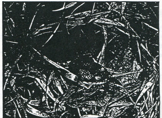
Figure 1. A melanistic adult female Heterodon platirhinos in the opaque period of ecdysis. To take this photograph, it was necessary to partially dislodge and expose this snake from its typical shedding posture and refugium (i.e., tightly coiled in the base of a clump of grass).

tivity occurrences. Various aspects of shedding were determined by an extended longitudinal analysis of three Heterodon (female no. 1 and males nos. 6 and 8), each of which was monitored in its normal habitat and home range for periods of 546, 702, and 491 consecutive days, respectively, and included two activity seasons. Each of these three snakes shed 3–5 times per year, averaging one shed each 37.0 ( SD = 6.5 ) days, and was inactive for 12.5 ( SD = 2.7 ) days preceeding each shed (Table 1). The number of sheds and number of inactive days preceeding sheds were similar for a given snake over two years as were the dates of shedding within and among snakes (Table 1). The inactive days preceeding shedding were spent under grass or mixtures of grass and herbs or leaves in open or edge habitats (Fig. 1). For each snake, the physical locations of shedding sites were distributed throughout the snake's large home range